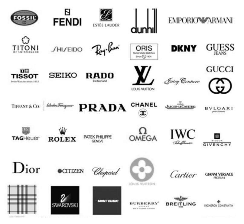
Fig. 1. Examples of famous brands

combination of the design elements, to identify the product of one or more categories [6]. In the representation of these symbols, this one or a class of products will be different from other products and services. Figure 1 contains a number of famous brand image designs.